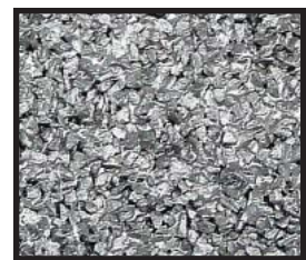
Eckel's Exceptional Grit Surface Structure

Performance - Eckel Coated Grit Face dies perform better than any steel tooth die when running (SUPER or HYPER) Chrome as these type tubulars are as hard or harder than heat treated steel dies.