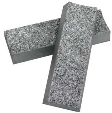
Contour Coated Rig Dies