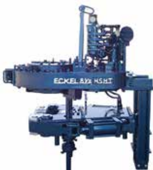
Eckel 8-5/8 HS HT Tong with Tri-Grip Backup

In normal steel tubular running operations the tong is used to make-up the initial threads and then the final torque is applied. With CRA material, strap wrenches are used to make-up the connection until hand tight, and final torque is applied with the tong.